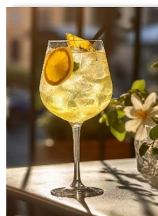
Limoncello Spritz 10.50