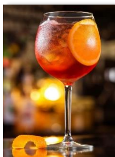
Aperol Spritz 10.50