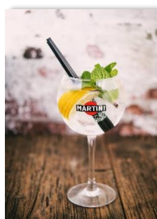
Martini Bianco non-alcoholic 9.50