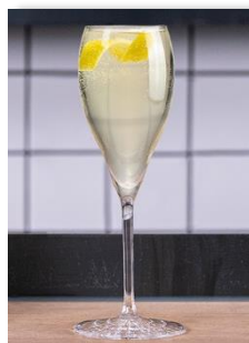
Bianco Rimuss non-alcoholic 8.50