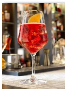
Campari Spritz 10.50