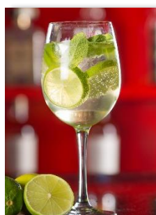
Hugo non-alcoholic 9.50