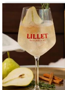
Lillet Blanc 10.50